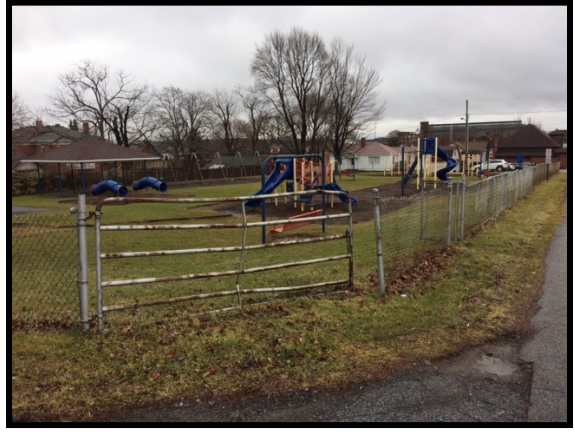
Center Ward Playground Fence

All playground equipment at both playgrounds is in excellent condition. The play surface at the east ward playground was replaced last year. The center ward surfaces will be re-edged, weeded and replaced this year.