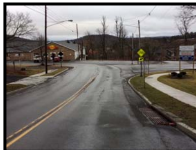
Center Street Trail Crossing