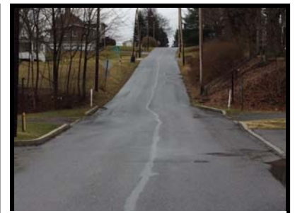
West Street Trail Crossing

Recommended Action – No action required.