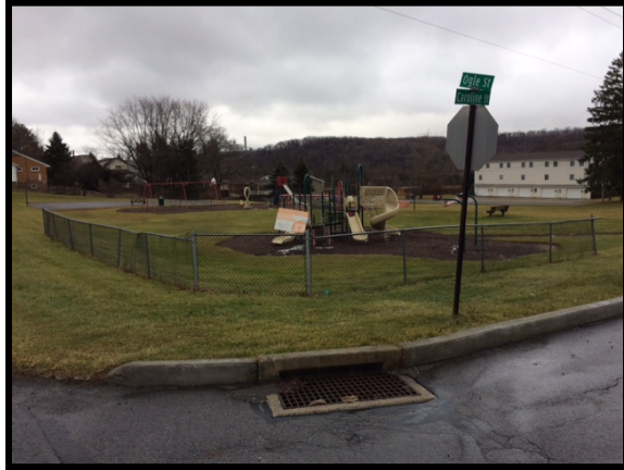
East Ward Playground Fence