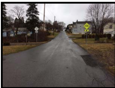
Locust Street Trail Crossing

Staff had been optimistic that a grant funding a joint project with Saltsburg for marking trail crossings would be approved. That grant was not approved. The Borough has enough materials on-hand from last year's PennDOT paving project to install new crosswalks at the trail crossings on Locust Street, Center Street and West Street. That will be completed in warmer weather.