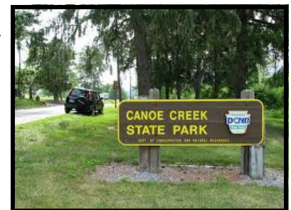
Canoe Creek State Park Entrance

The area surrounding Canoe Creek State Park is rich in limestone. The limestone was quarried and used for many purposes like providing materials for the iron and steel industries of Pennsylvania. There are two abandoned lime kilns within the park boundaries from the 1900s, operated by the Blair Limestone Company. Limestone was burned to produce "quicklime" in these kilns.