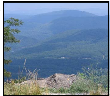
View from Cove Mountain Road (Rt. 164)

Route #164 is a steep ride up Cove Mountain into Martinsburg. The view is terrific, with many turns.