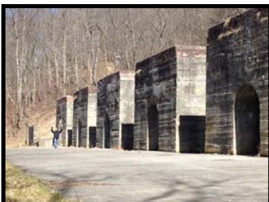
Abandoned Lime Kilns at Canoe Creek

Once on Route #22, head west toward Hollidaysburg. 1½ miles west of Route #866 turn right for a ride around Canoe Creek State Park on Beaver Dam Road and Scotch Valley Road.