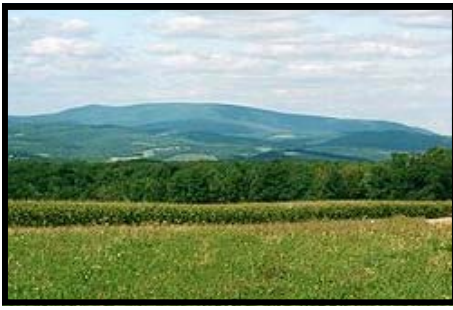
Blue Knob Mountain

Blue Knob Mountain is the second highest peak in Pennsylvania at 3,146 ft. If you stay on Route #869 through Pavia, you go around the mountain. If you take the side trip to the fire tower (highly recommended) you go over the mountain.