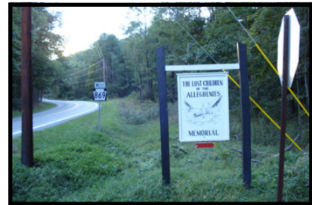
Entrance to Cox Monument