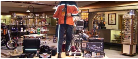
Apple Harley Davidson Store

From Canoe Creek State Park follow Scotch Valley Road to Hollidaysburg, head out North Juniata Street and make a stop at Apple Harley Davidson. They have a complete store for motorcycle parts and accessories.