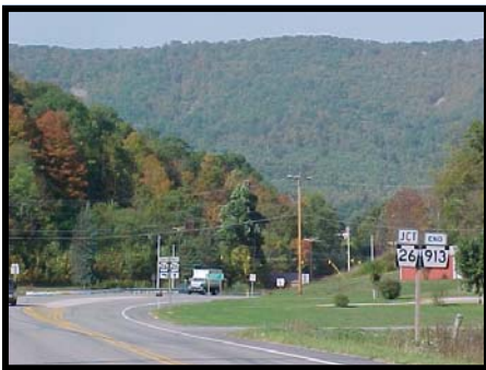
Rt. 913 from Saxton meets Rt. 26

In downtown Everett turn left onto Route #26. This will take us out past Raystown Lake and Saxton through Warriors Path State Park, where we will turn left onto Route #164 up over the mountain toward Martinsburg.