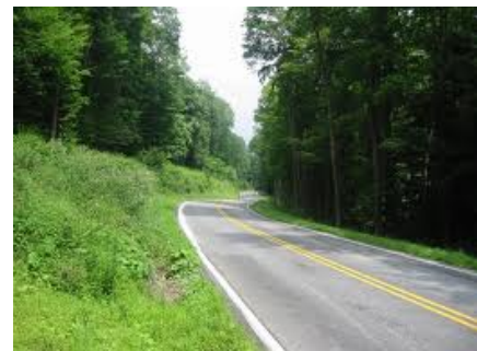
Rolling Road Through Blue Knob

For this side trip, turn left in Pavia and follow the park road for about four miles. Make a sharp right onto State Forest Road, and turn left after ½ mile to the old fire tower. After visiting the fire tower, return to State Forest Road and continue on it. Turn right onto Ski Gap Road and follow it down the mountain to Claysburg. Turn right on Old Route #220 to Osterburg.