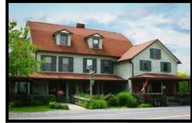
Dillweed B&B, Gift Shop & Cafe

Follow Route #403 back up and across Route #22. About 1 mile north of Route #22 you come to the very small village of Dilltown, which serves as a trail head for the Ghost Town Trail. Stop at the Dillweed B&B and visit the Trailside Gift Shop. They also have a small café there where you can grab a sandwich, coffee, herb teas, desserts or pastries... and ice cream!