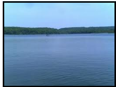
Yellow Creek State Park

After only two miles on Route #422 you turn left on Route #259S into Yellow Creek State Park. In the small village of Brush Valley you finally reach Route #56. You will stay on Route #56S across Route #22, through Armagh and along the west rim of the Conemaugh Gap all the way into the west end of Johnstown. About 10 miles west of Seward there will be a scenic overlook.