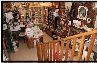
Dillweed's Gift Shop