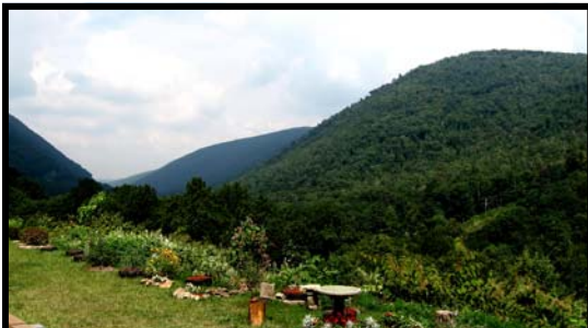
Conemaugh Gap Scenic Overlook on Rt. #56

After a short ride on city streets, you take the bridge across the Conemaugh River, pick up Route #403N, and ride back along the east rim of the Gap.