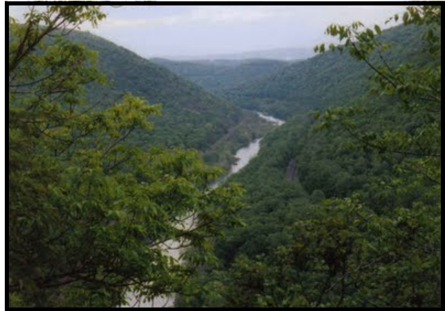
The Conemaugh Gap

This is a nice scenic ride west of Ebensburg and down to Johnstown and back. Rather than the normal highway route, this route takes you down the west side of the Conemaugh Gap and brings you back along the east rim. This ride is only 78 miles long and takes just 2 hours.