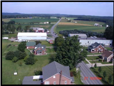
Looking West from Nicktown toward Alverda

The Conemaugh Gap is known for being the deepest gorge east of the Mississippi River; 1,350 feet. The Gap can be viewed from the Conemaugh Gap Scenic Overlook, a pull-off on Haws Pike (Route 56 between Johnstown and Seward). The Conemaugh Gap runs for seven miles and was formed by the Conemaugh River cutting through the Laurel Ridge Mountain.