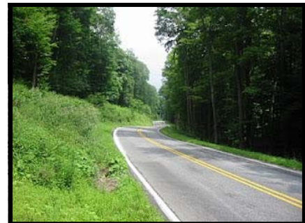
Twisty Road Through Blue Knob

We continue on Rt. 30 through Bedford and onto Everett where we meet Rt. 26. We follow Rt. 26 up past Saxton, and turn left onto Rt. 164. This is a great ride up over the mountain toward Roaring Spring. We will stay on Rt. 164 across Rt. 99 and even further up the mountain past Blue Knob State Park. Rt. 164 eventually brings us into Portage. Munster Road will bring us up to Rt. 22 and back to Ebensburg.