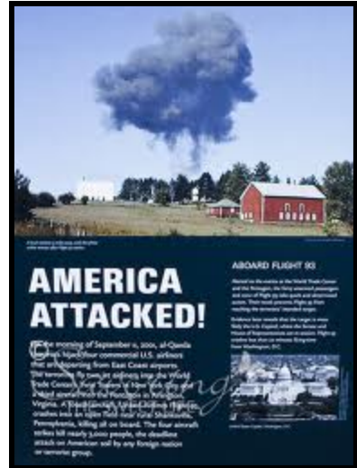
Flight 93 Memorial

We follow that to Rt. 31 and head east again on Rt. 31 toward Somerset. This is a very nice ride up over Laurel Mountain past Hidden Valley Resort and near Seven Springs Resort. Beyond Somerset we continue on to Rt. 160. We take Rt. 160 up to the area of Indian Lake, and turn left toward Shanksville.