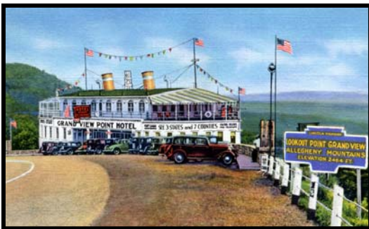
Historic Ship Hotel on Rt. 30

Shanksville is of course the site of the Flight 93 Memorial. Just past the Memorial, we turn east on Rt. 30. Rt. 30 is another very scenic drive as we approach Bedford. Stop and see the beautiful scenic overlook. The ship hotel has since burned.