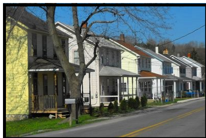
Mine 42 Company Houses

Turn left onto Route #160 and after only a few miles turn left onto Krayn Road. At the end of the road, turn right onto Mine 42 Road. Follow this into the Village of Mine 42. The Mine 42 portal was operated from 1907 until 1951 by Berwind-White Coal Mining Company. The social club today was once the mine's car barn.