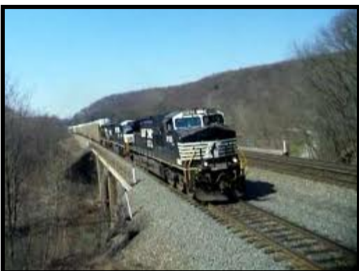
Train approaching Wilmore from Summerhill

Wilmore is situated along the Norfolk Southern Railroad. In fact, during today's ride you will see this railroad again along with several branches and secondaries. Wilmore is known for the "track pans" constructed there for the steam railroad. While the train continued at fast speed, large scoops dropped down into pans along the tracks and filled the train's tender with water for its steam.