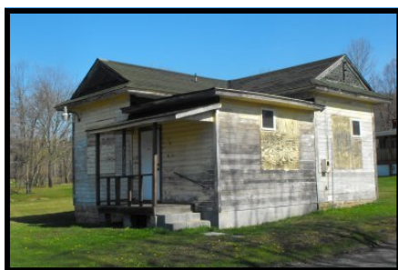
Mine 42 First Aid Station

Centennial Drive takes you through Mine 42 and out to Elton, where you once again join Route #160 (Forest Hills Drive).