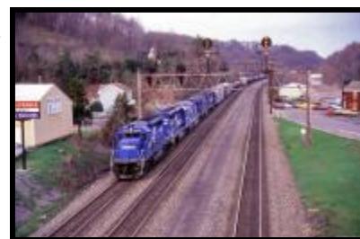
Mainline of Railroad Through Center of Summerhill

After your park visit, continue out to the end of Lake Road, make a right onto Frankstown Road, then a left onto Nelson Road. This is a twisty road that brings you down onto Route #53 in Summerhill. There are two good places to eat in Summerhill, and both serve good lunches and dinners. Rita's Restaurant is along Route #53 as soon as you enter Summerhill. Vince's Place is on Main Street in Summerhill, and also serves alcoholic beverages.