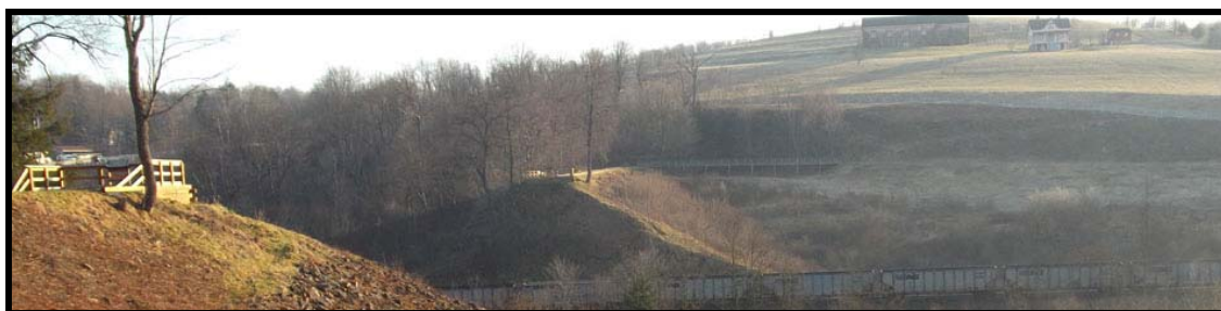
Johnstown Flood National Memorial

From Elton we follow Helsel Road and Palestine Road into Salix and then WPA Road down the mountain to the village of St. Michael. Turn right on Route #869 and make an immediate left onto Lake Road. On Lake Road you will want to stop at the Johnstown Flood National Memorial. See the ruins of the South Fork Dam, take a short walk around the park, or watch the short film "Black Friday". This is definitely worth the stop.