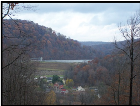
Saltlick Reservoir above town of Mineral Point

We head northwest out of Summerhill on Swigle Mountain Road and turn left onto Mineral Point Road. This twisty road will follow farmland, and then wind down over the mountain into Mineral Point. There are two sites you might want to visit while in the small town of Mineral Point.