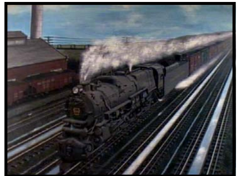
Painting of Wilmore Track Pans by Fred Connacher

Wilmore is situated along the Norfolk Southern Railroad. In fact, during today's ride you will see this railroad again along with several branches and secondaries. Wilmore is known for the "track pans" constructed there for the steam railroad. While the train continued at fast speed, large scoops dropped down into pans along the tracks and filled the train's tender with water for its steam.