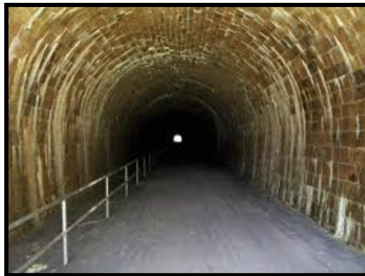
Staple Bend Tunnel

The Staple Bend Tunnel is just outside of Mineral Point. The tunnel was the first railroad tunnel in America. Constructed in 1883, it is 900 feet long.