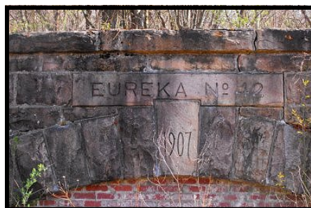
Sealed Mine 42 Portal

The houses were all company houses constructed in 1910. The company store, stable and slaughter house still stand. Across the street one can still see the old first aid station.