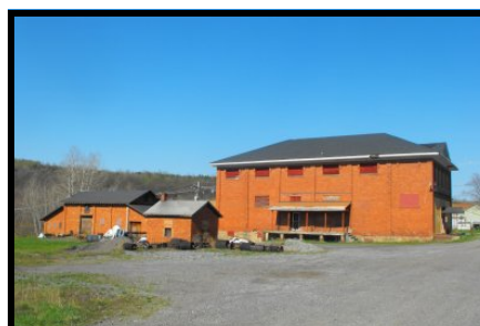
Company Store, Stable & Slaughter House

From Elton we follow Helsel Road and Palestine Road into Salix and then WPA Road down the mountain to the village of St. Michael. Turn right on Route #869 and make an immediate left onto Lake Road. On Lake Road you will want to stop at the Johnstown Flood National Memorial. See the ruins of the South Fork Dam, take a short walk around the park, or watch the short film "Black Friday". This is definitely worth the stop.