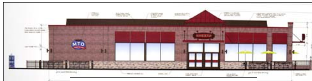
Proposed view from W. High Street

In addition to these changes, there are new occupancies planned but still unannounced for several of the buildings along West High Street. By the end of 2015, West High Street will have an entirely new look!