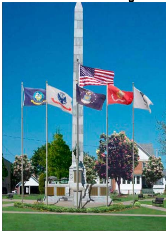
Veteran's Park, 2011