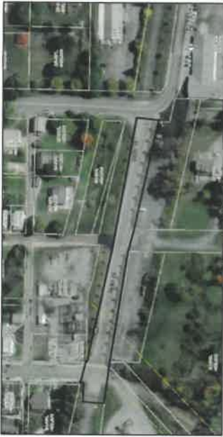
LOCATION MAP (N.T.S.)