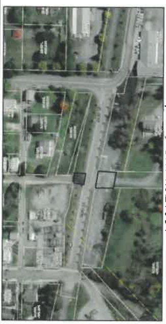
LOCATION MAP (N.T.S.)