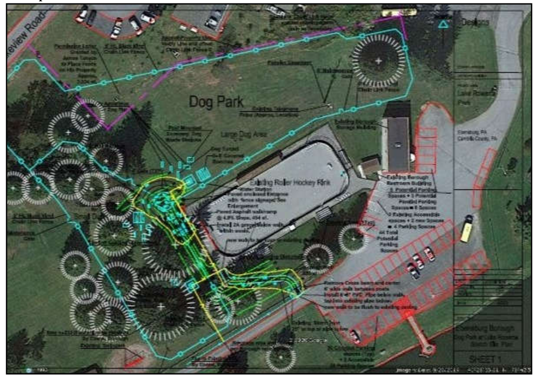
Thank you to the Rotary Club of Ebensburg for their efforts in bringing this Dog Park to our community!