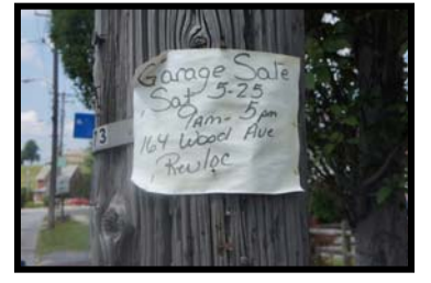
Sign for a May sale still up in August

Ordinance #607 defines what all is considered to be a garage sale; limits the frequency and hours; limits the number, size and location of signs; and requires that signs be removed immediately after the sale.