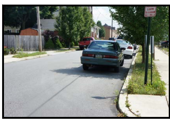
Looking right when pulling from 100 block of North Beech St.