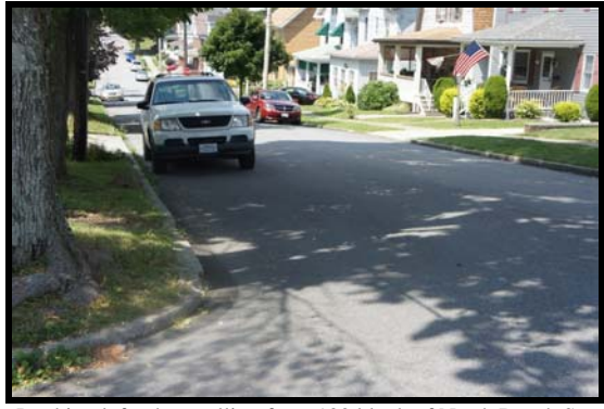
Looking left when pulling from 100 block of North Beech St.

A resident asked Council to consider limiting parking on West Sample Street near the intersection with Beech Street. Drivers approaching Sample Street when traveling north on Beech Street have difficulty seeing oncoming traffic. Signs prohibiting parking "Here to Corner" were suggested.