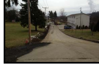
East Triumph Street Waterline

Fabricating the clarifier weir extensions. Backwash tank floor completed. Tank construction halted due to snow.