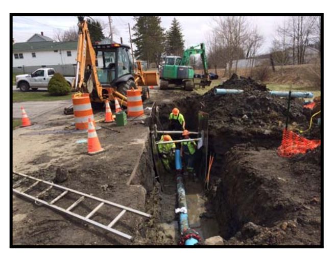
Borough crews complete work lowering a water main

<u>Recommended Action</u> – No action required.