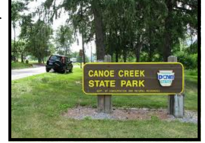
Canoe Creek State Park Entrance

The area surrounding Canoe Creek State Park is rich in limestone. The limestone was quarried and used for many purposes like providing materials for the iron and steel industries of Pennsylvania. There are two abandoned lime kilns within the park