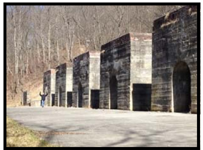
Abandoned Lime Kilns at Canoe Creek

Once on Route #22, head west toward Hollidaysburg. 1½ miles west of Route #866 turn right for a ride around Canoe Creek State Park on Beaver Dam Road and Scotch Valley Road.