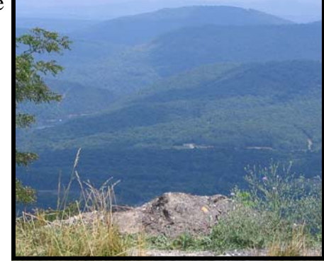
View from Cove Mountain Road (Rt. 164)

In Martinsburg turn right onto Route #866 to Williamsburg, the birthplace of Charles Schwab. In Williamsburg, you can stay on Route #866 toward the west and follow the Juniata River out to Route #22. Or, stay straight on High Street to the north and follow a rural road out to Route #22. The