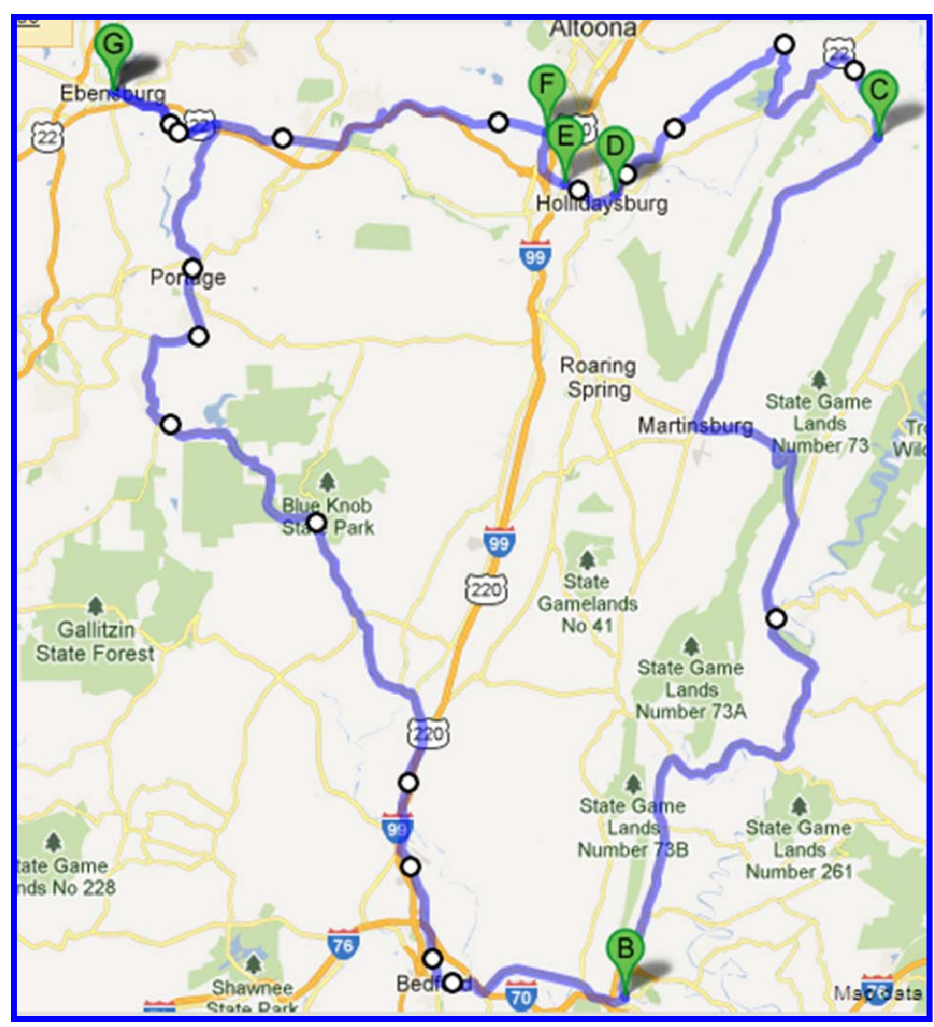
Bedford & Blair Counties Day Trip Route

Total ride time on this day trip to Bedford and Blair counties is 4:15, and we will have traveled 140 miles.