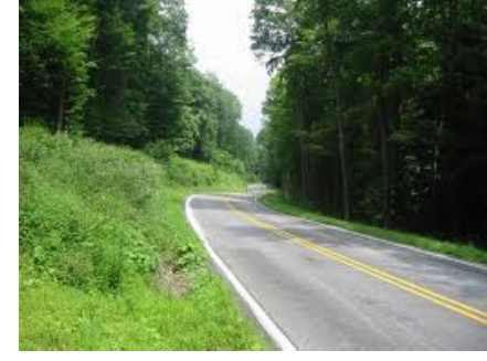
Rolling Road Through Blue Knob

For this side trip, turn left in Pavia and follow the park road for about four miles. Make a sharp right onto State Forest Road, and turn left after ½ mile to the old fire tower. After visiting the fire tower, return to State Forest Road and continue on it. Turn right onto Ski Gap Road and follow it down the mountain to Claysburg. Turn right on Old Route #220 to Osterburg.