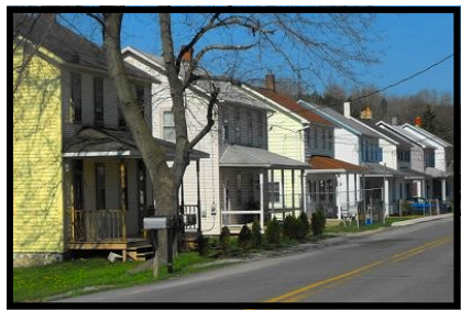
Mine 42 Company Houses

The houses were all company houses constructed in 1910. The company store, stable and slaughter house still stand. Across the street one can still see the old first aid station.