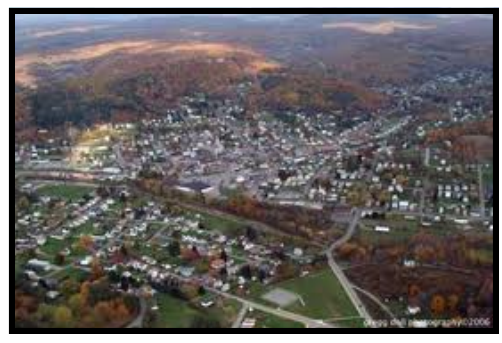
Northern Cambria Borough

From Northern Cambria, you head up Nicktown Hill Road (Route #271) to Nicktown.