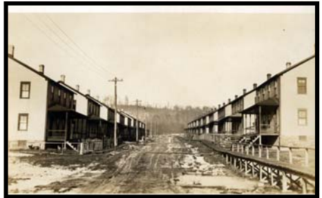
Mine 37 street and elevated sidewalks

The Eureka No.37 Mine operated from 1899 to 1962. The only coal-related structure still standing is the machine shop constructed in 1924. The coal company also erected 88 wood frame duplex houses to house the miners. The houses rented for $7/mo. in 1911. The new town also contained two brick school buildings, a company store and a hotel. Forty of the houses remain and have been substantially altered.