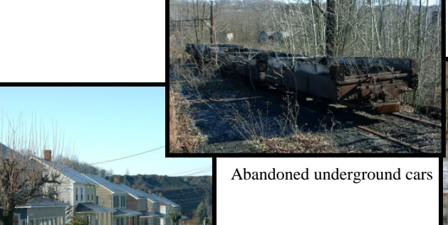
Mine 40 today

Next you cross Route #56 through Scalp Level to Mine 40. As you turn off Main Street toward Mine 40, visit the Mine 40 Overlook. Eureka Mine 40 was one of Berwind's largest and best-equipped Eureka mines, producing 22 million tons of coal between 1905 and 1955. The town is now a National Historic District. Notable buildings include over 100 2-story miner duplexes, the power house, drift openings, cleaning plant, motor barn, fan house, sand tank, railroad repair car shop and wash house.