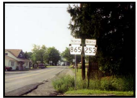
Main Intersection in Glasgow

Coalport is a very old town of less than 500 people, just across the line in Clearfield County. It's downtown area is relatively depressed and is on the National Register of Historic Places. There is only one restaurant, but there is what appears to be an interesting hardware store, McNulty's, built in 1875. It is just two blocks to the left as