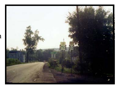
Intersection of Routes 53 & 253

County on Westover Road. Shortly you are back in Cambria