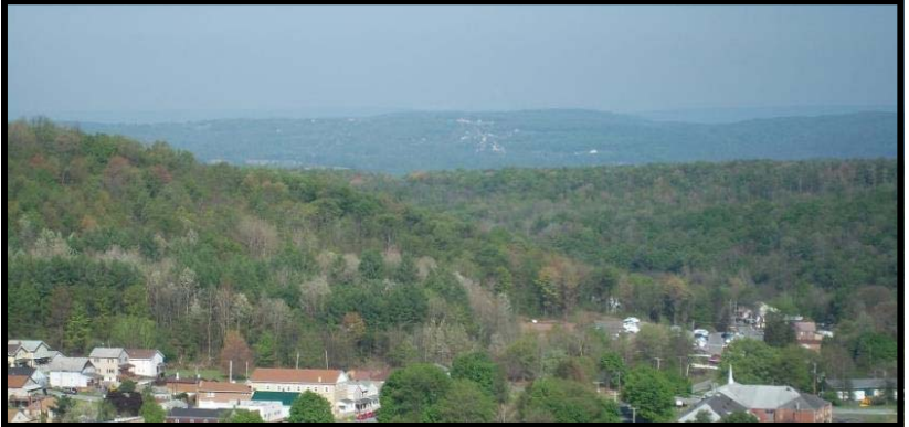
The road ahead from Beaverdale to Ebensburg

The photo to the left shows the road ahead that you will follow to Ebensburg. You will climb in elevation the whole way, beginning with your first turn leaving Beaverdale on Washington Avenue.