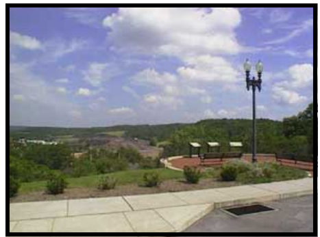
Mine 40 Overlook in Scalp Level

Next you cross Route #56 through Scalp Level to Mine 40. As you turn off Main Street toward Mine 40, visit the Mine 40 Overlook. Eureka Mine 40 was one of Berwind's largest and best-equipped Eureka mines, producing 22 million tons of coal between 1905 and 1955. The town is now a National Historic District. Notable buildings include over 100 2-story miner duplexes, the power house, drift openings, cleaning plant, motor barn, fan house, sand tank, railroad repair car shop and wash house.