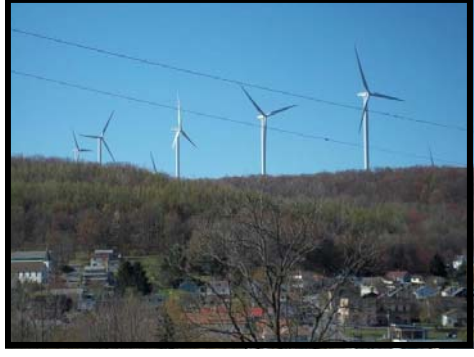
Windmills on ridge above Beaverdale

Continue out Mine 42 Road through the villages of Krayn and Llanfair on your way to Dunlo. As you pass through Dunlo toward Beaverdale, you will be close to the base of the large windmill farm. The windmills line the ridge all the way into Beaverdale.