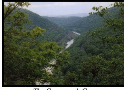
The Conemaugh Gap