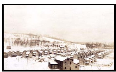
Mine 37 in early 1900s

After climbing St. Clair Road to Westmont you travel Menoher Boulevard, Fender Lane and then Coon Ridge Road back down the mountain to Somerset Pike. Then it's through Ferndale and up Eisenhower Boulevard, heading into the small mining town of Mine 37.