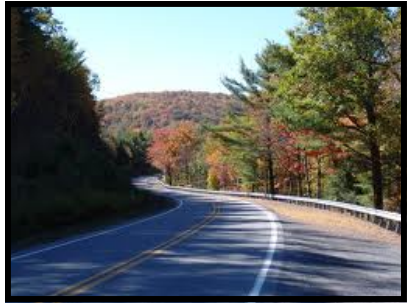
Route 144 south of Renovo

We continue out Rt. 45 to Centre Hall where we turn west onto Rt. 144. We will pass through Bellefonte, Milesburg, Snowshoe and Moshannon. Rt. 144 turns northeast, where we will ride through Sproul State Forest on our way to Renovo. From Renovo we will head west on Rt. 120, but we need to make one out-of-the-way stop first. Six miles east of Renovo on Rt. 120 is