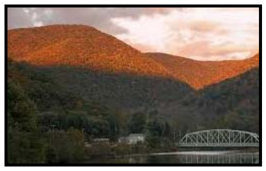
Town of Sinnemahoning

Rt. 120 is another very scenic highway. We follow it from Renovo to Sinnemahoning.