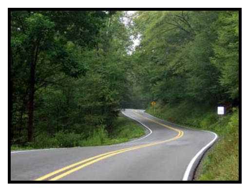
Wykoff Run Road

It is especially important to watch out for wildlife on Wykoff Run. It is not unusual to encounter elk, deer, turkey buzzards, and even a bear.