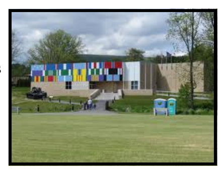
Pa Military Museum, Boalsburg