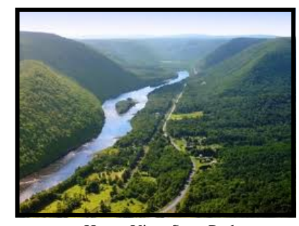
Hyner View State Park

From there it's due west on Rt. 120 to Sinnemahoning. Rt. 120 is also known as the Bucktail Trail.