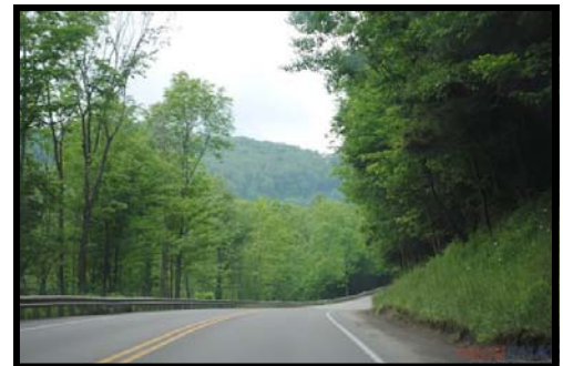
Route 66 through Allegheny National Forest

In Ridgway turn northwest onto Route 948 which enters the Allegheny National Forest. Turn left on Route 66 for a scenic route through the forest and eventually south to Clarion.