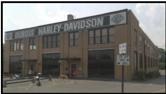
Dubois Harley Davidson

While passing through Dubois, be sure to stop by the local Harley Davidson shop. It's right along Route 219.