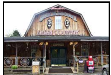
Smicksburg Amish Country Store

Smicksburg is a very small town in Indiana County and a very interesting place. There is a large Amish population in this area. Smicksburg is only a few blocks long but has several quaint unique shops. Spend a little time here going from shop to shop. At a minimum, on your way out of town stop at the Amish country furniture store on your right.